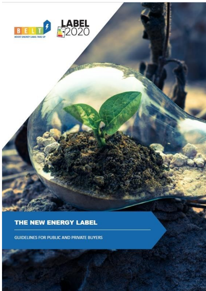
Fig. 5: the cover of the Guidelines for public and private buyers.