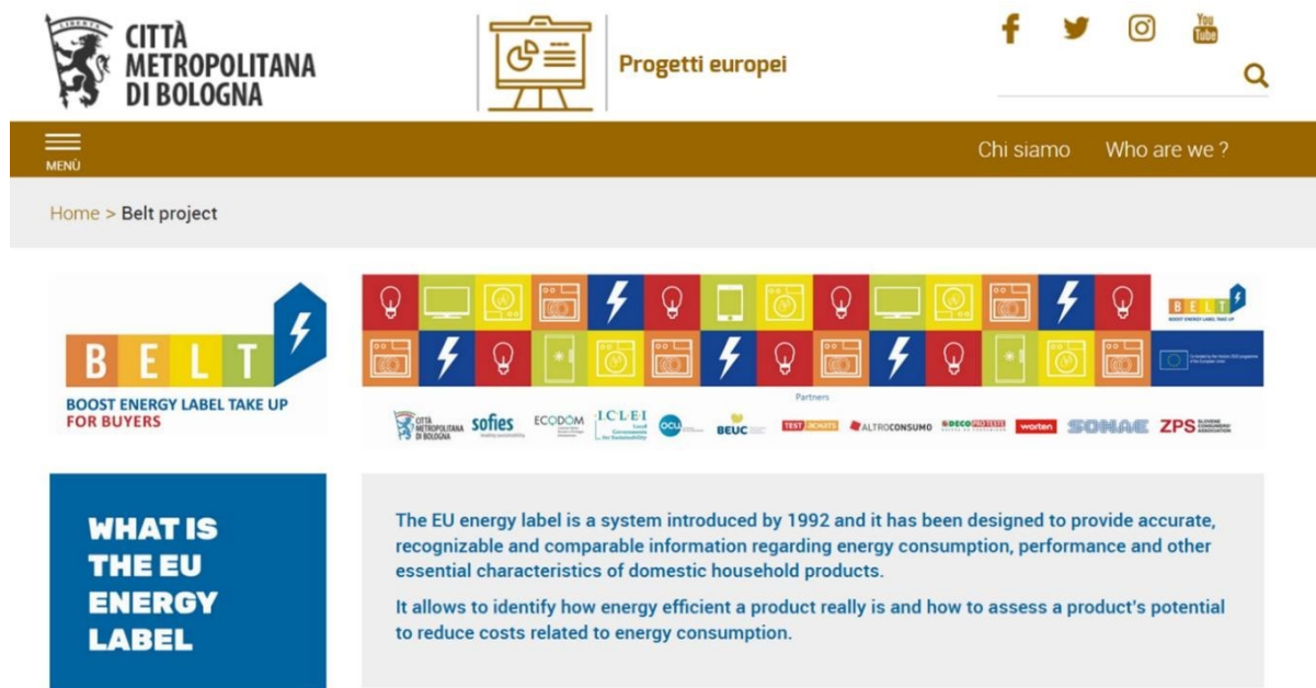
Fig.3: The top of the landing page.

The landing page is an illustrative page on the web hosted by the Metropolitan City of Bologna website and linked from the project website for all public and private purchasing operators. The landing page URL is: https://www.cittametropolitana.bo.it/progetti_europei/Belt_project